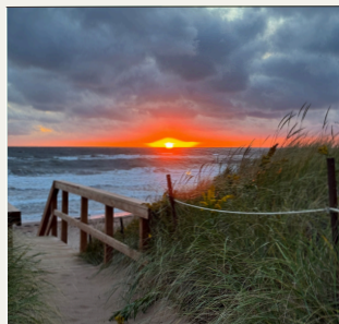
Carl Doucette landscape category winner 2025