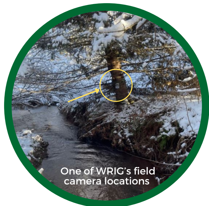
One of WRIG's field camera locations

Encouragingly, another group of otters has been documented recently in the Morell River by their watershed association, and a group in the west had sightings as well! As of 2023, PEI is estimated to support a total of two dozen river otters, though this number is difficult to determine without further monitoring. Staff from the PEI department of Forests, Fish & Wildlife have developed a monitoring program to better understand the otter population, and WRIG is happy to be partaking in this initiative! WRIG has 2 field cameras (see photo on right) installed in locations where local residents have reported potential sightings. These cameras are checked about every 2 weeks and will be left in place to capture photos of wildlife through the winter and into next spring. To help monitor for these animals, please report any potential otter sightings to your local watershed group or directly to Fish & Wildlife.