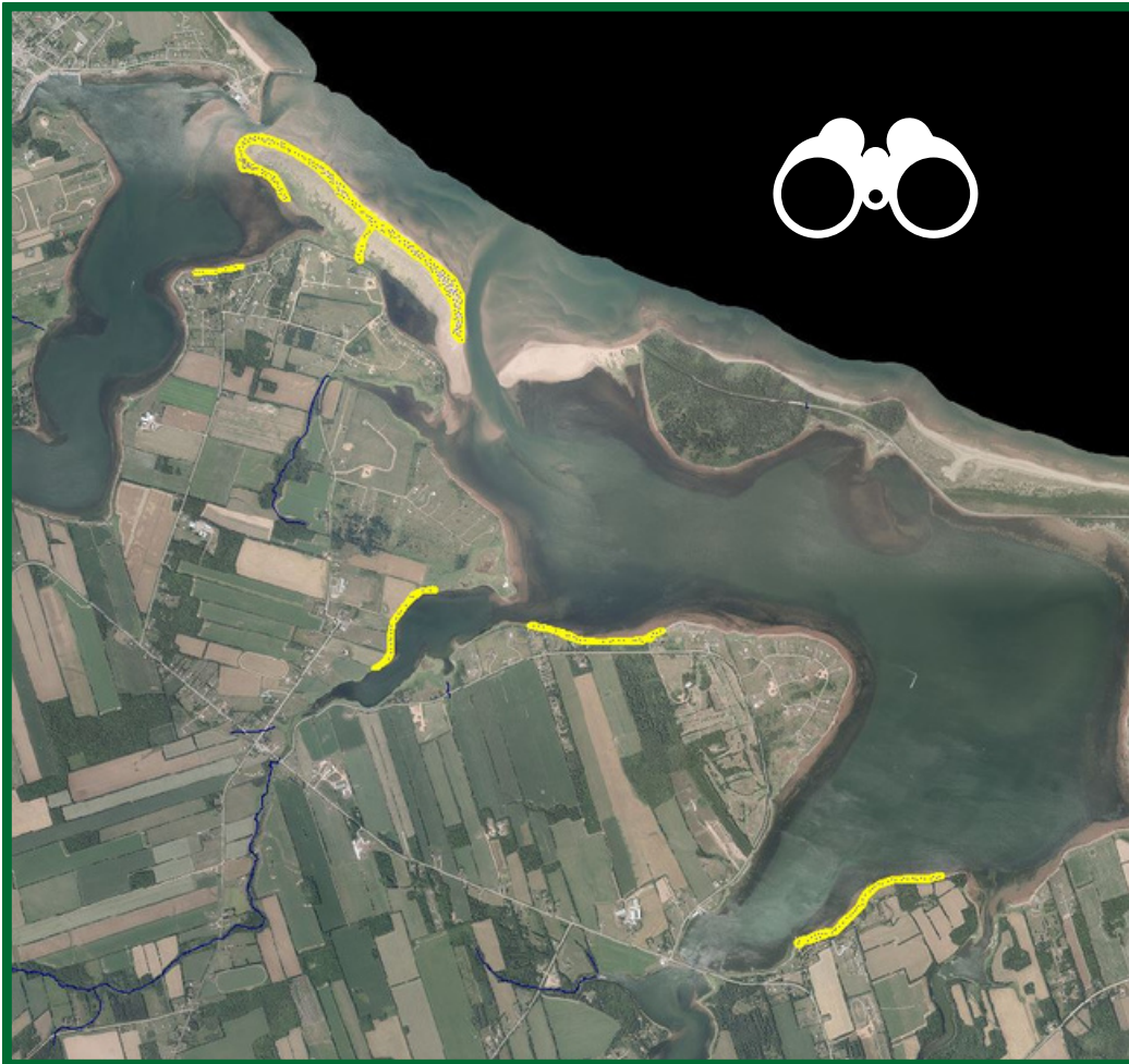
Map of South Rustico, Cymbria and Oyster Bed Bridge, showing the sections of shoreline where WRIG cleaned up beach debris (yellow lines) and a summary of WRIG's work shown to the right of the map (green bubbles)

In the aftermath of hurricane Fiona, the PEI Aquaculture Alliance partnered with the PEI Watershed Alliance to coordinate efforts to clean up our beautiful Island shoreline. The Wheatley River Improvement Group, along with all other Island watershed groups, received special funding to dedicate to cleaning up debris from beaches in each of our watershed areas. In addition, our staff recorded areas containing “large coastal waste” and reported these findings to the Watershed Alliance. This allowed for a coordinated effort to prioritize removal of large debris by machinery during a less sensitive timeframe for wildlife. WRIG would like to thank the PEI Aquaculture Alliance for funding this Island-wide shoreline clean up initiative!